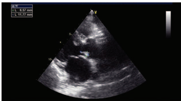
Figure 1. The echocardiogram showed a strong echo of 1.17*0.66 cm at the valvula coronaria sinistra valvae aortae.

The 2015 European Society of Cardiology Guidelines [8] recommend that antibiotic prophylaxis should be considered for patients at highest risk for IE, which included patients with any prosthetic valve, a previous episode of IE, and congenital heart diseases. Antibiotic prophylaxis is not recommended for gastroscopy, colonoscopy, cystoscopy, vaginal or caesarean delivery, or transesophageal echocardiography. [8] Rerknimitr et al [9] showed that prophylactic antibiotics may not be needed in nonbleeding gastric varices after endoscopic injection of cyanoacrylate. However, 2010 Asian Pacific Association for Study of the Liver [10] recommended that third-generation cephalosporins should be given during EVL in acute variceal bleeding. A study [11] showed that there was a significant risk of asymptomatic bacteremia and bacterial peritonitis after EVL. Meanwhile, Lin et al [11] considered that the use of prophylactic antibiotics should be reserved for patients with Child's C class