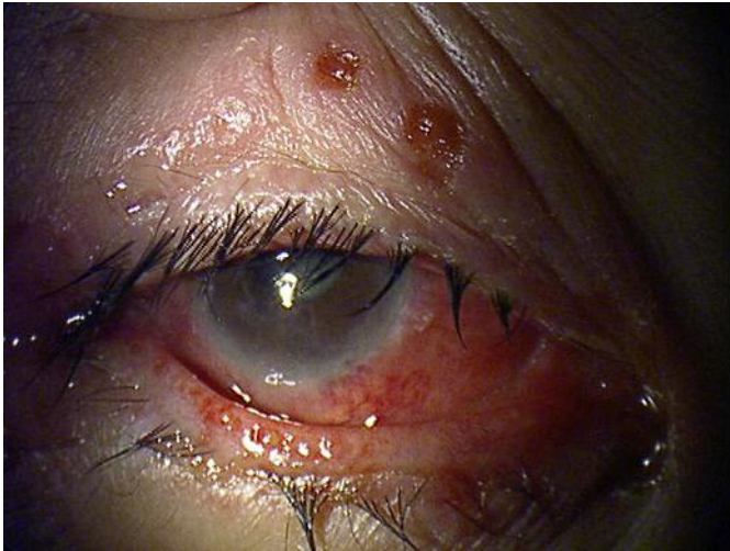
Fig. 1. A photograph showing blepharitis with vesicles of the lid margin and conjunctival injection.