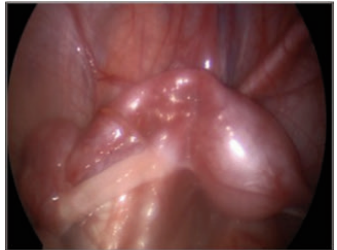
Figure 2. Laparoscopic image of streak gonad.