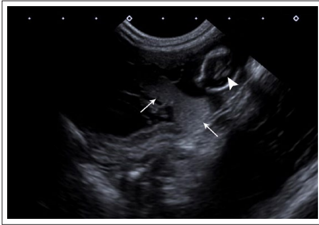
Figure 1 Ultrasonographic image of the gravid uterus including one fetal head. The choroid plexi are visible as two small symmetric hyperechoic structures (arrowhead) within the fetal brain. The falx cerebri is visible as the straight echoic line between these structures. A moderate amount of markedly echogenic intrauterine fluid is present (thin arrows)