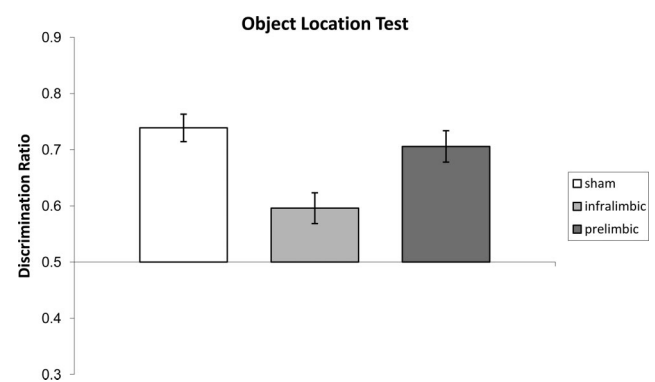
Figure 2. The effect 6-OHDA lesions to the prelimbic and infralimbic medial prefrontal cortex on location recognition memory. Test performance for sham (white bars) infralimbic (light gray bars) and prelimbic (dark gray bars) are presented as discrimination ratios. Performance above 0.5 indicates a preference for the displaced object.