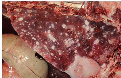
Fig. 2. Dam's lung showing widespread, multifocal, granulomatous pneumonia caused by Coccidioides spp.

A serum sample obtained from the dam at the time of the abortion was tested at the coccidioidomycosis serology laboratory at the University of California, Davis. The serum was positive for coccidioidal IgG antibodies by qualitative immunodiffusion (in-house assay) and the titer determined by quantitative immunodiffusion (in-house assay) was 1:256, which is interpreted as an indicator of disseminated coccidioidomycosis. The dam was euthanized. A postmortem examination and histopathology revealed disseminated coccidioidomycosis severely affecting the lungs (Fig. 2) and serosal membranes of the thoracic cavity, and mildly involving other organs such as the liver, kidneys, and uterine neck and horns. Fungal spherules similar to those described for the fetus were scant and were only seen within a few of the pyogranulomas in the lungs and liver, but were not seen within the pyogranulomas of the kidneys or uterus. The dam was seropositive for bluetongue virus by a cELISA (VMRD Inc.) and seronegative for Brucella abortus by diagnostic card test (National Veterinary Services Laboratories), bovine viral diarrhea virus type-1 and 2 by serum viral neutralization