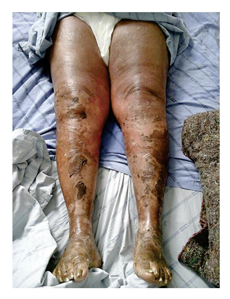
Fig. 1. Diffuse exfoliative lesions on the legs.

Guerreiro de Moura et al.: A Case of Acute Generalized Pustular Psoriasis of von Zumbusch Triggered by Hypocalcemia