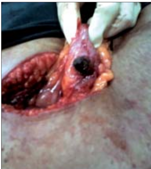
Figure 2: Right transverse colon with gall stone in fistula