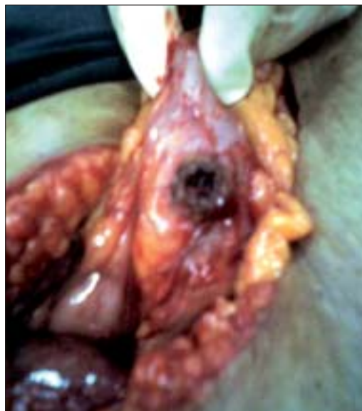
Figure 3: Fistula in the right transverse colon

hours later, after the pyrexia had settled, an endoscopic retrograde cholangiopancreatography (ERCP) was done; the cholangiogram revealed a dilated CBD with a filling defect in the lower end of the CBD, which was suggestive of a calculus. The cholangiogram did not show any fistulous communication between the gall bladder and the colon. A sphincterotomy was done along with an extraction of the stone and clearance of the CBD with a temporary stenting of the common bile duct.