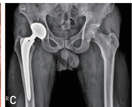
Fig. 2. (A) Anteroposterior radiograph of pelvis (patient 1) shows fractured ceramic particles (arrow). (B) Intraoperative photograph shows fractured ceramic liner. (C) Radiograph taken 9 years after revision surgery shows no osteolysis or implant loosening.