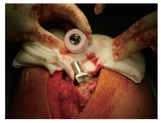
Fig. 1. Metal adaptor was used because of taper damage.

A thorough synovectomy was performed at the time of revision surgery to prevent possible complications (e.g., third-body wear caused by residual ceramic particles and metallosis). Irrigation was repeated several times to remove any ceramic particles remaining in the adjacent soft tissue and bearing surfaces. One of the two patients with ceramic head fracture underwent revision using the fourth-generation ceramic bearing with metal adapter concerning plastic deformation of the Morse taper junction (Fig. 1); the other patient with head fracture underwent revision of the cup. The 6 patients with ceramic liner fractures underwent revision using the third-generation CoC bearings from the same manufacturer by replacing the original component to the