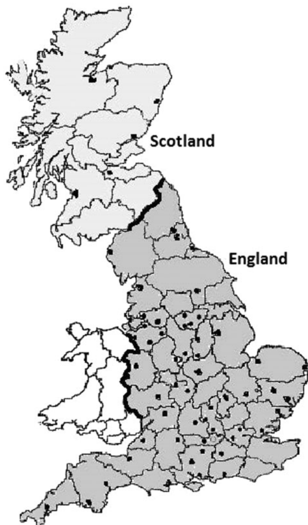
Figure 1. Location of the 66 NHS breast screening clinics through which Million Women Study participants were recruited ■. Figure adapted from Figure 1 of the original article 'The Million Women Study Collaborative Group: The Million Women Study: design and characteristics of the study population [peer-reviewed research]. Breast Cancer Res 1999; 1: 73–80. The original article is an open access article distributed under the terms of the Creative Commons Attribution License [ http://creativecommons.org/licenses/by/2.0 ], which permits unrestricted use, distribution, and reproduction in any medium, provided the original work is properly cited.

The study was set up in collaboration with the NHS Breast Screening Programme, and is now funded mainly by the UK Medical Research Council and Cancer Research UK. Further information, including the study protocol, copies of questionnaires, data collected, data access policy and list of publications can be found on the study website [ www.millionwomenstudy.org ].