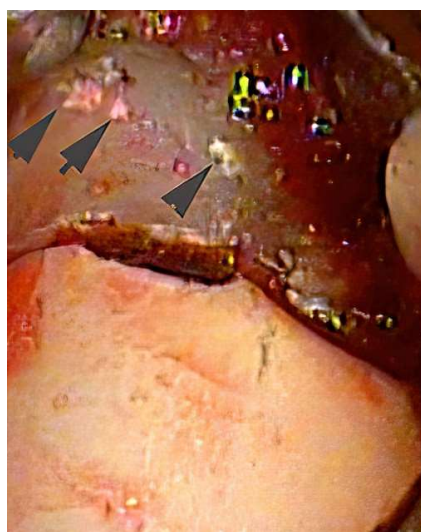
Figure 2. During videoscope assisted minimally invasive surgery (VMIS), multiple areas of residual calculus (arrows) are noted to remain after SRP. The position of the calculus is in an area of deep pocket probing depth and would be very difficult to access during blind SRP. (Videoscope photo 40× magnification).

In most cases where SRP is not successful in controlling inflammation, clinical experience indicates that there is usually subgingival calculus present that has not been removed. Figures 2 and 3 show areas of residual subgingival calculus remaining after SRP that was performed on an anesthetized patient by a periodontist. Because most sulcular inflammation is associated with calculus, it is necessary to remove the residual calculus with advanced therapy [10,30]. Advanced therapy can range from the use of enhanced non-surgical visualization with an endoscope or videoscope to surgical access. Both the use of enhanced visualization or surgical access are aimed at improved visualization for the removal of residual calculus. The surgical removal of calculus may be an initial step in a procedure aimed at regeneration of lost periodontal tissues. However, for a successful regenerative procedure it is necessary to have a calculus free root surface to prevent a return of inflammation [20,30]. The studies showing that calculus may represent an alternate pathway from plaque that leads to epithelial cell death gives further weight to the necessity of removing all calculus [31–33]. The use of chelating agents for root modification and the removal of microislands of calculus may be a further necessary step beyond current routine surgical and non-surgical methods [20].