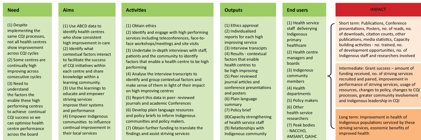
Figure 1 Modified programme logic model. AMSANT, Aboriginal Medical Services Association of the Northern Territory; CQI, continuous quality improvement; NACCHO, National Aboriginal Community Controlled Health Organisation; QAIHC, Queensland Aboriginal and Islander Health Council.

review of published information on potential impact metrics. The review (undertaken for three of the CRE-IQI Flagship Projects) resulted in lists of potential benefits such as the Becker Medical Library Model for Assessment of Research Impact, 17 the Ideas Book from the RAND Corporation 18 and other examples. 19–24 However, many of the published impact metrics were not directly applicable to LFTB. A process was undertaken to map the activities of LFTB to suitable published metrics then supplement them with customised metrics that related directly to LFTB; these supplementary metrics were determined by the independent assessor in consultation with LFTB researchers.