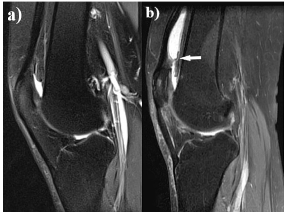
FIGURE 2: MRI images of the patient

a) MRI performed for patellar tendonitis before the first operation. No pathology detected in the suprapatellar region, except no-passage of synovial fluid to the suprapatellar area; b) MRI image of the mass in the suprapatellar pouch before the re-arthroscopy. Liquid intensity mass isolated from the joint cavity by a band-like structure (arrow).