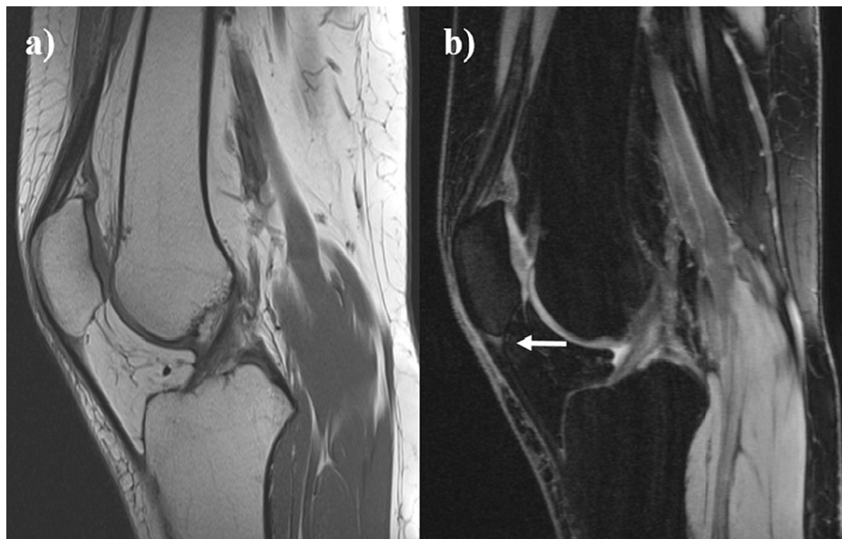
FIGURE 1: MRI images of the patient diagnosed with patellar tendinitis

a) T1-weighted image b) T2-weighted image shows increased signal intensity at the inferior pole of patella (arrow).