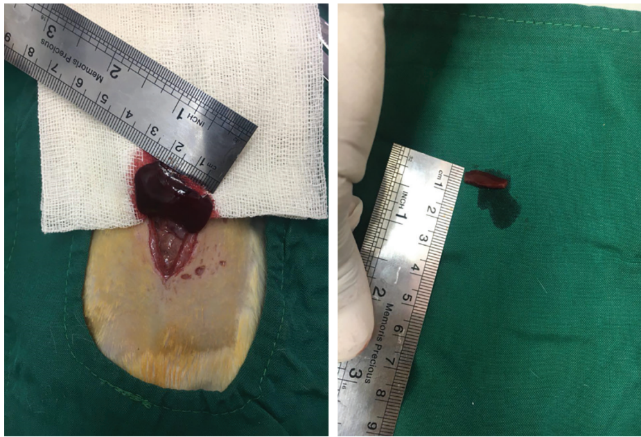
Fig. 1. A laceration model in the middle lobe of the liver.

cages under the care of a veterinarian and standard care including food and water.