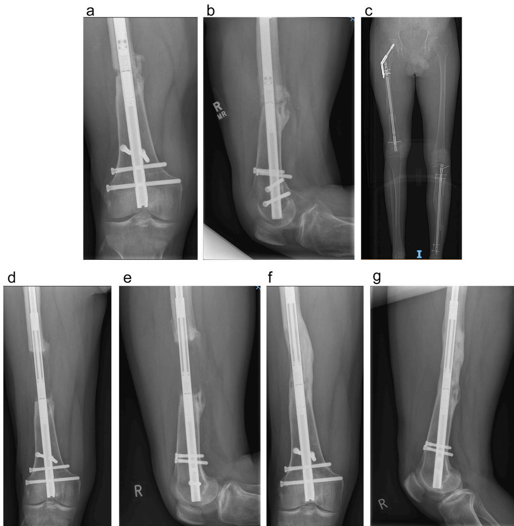
Fig. 1. a: AP X-ray of broken distal locking screws, non-union with limited callus formation. b: Lateral X-ray of broken distal locking screws, non-union with limited callus formation. c: AP X-ray showing the leg length discrepancy before PRECICE nail insertion. d: AP X-ray of distraction osteogenesis but no consolidation yet. e: Lateral X-ray of distraction osteogenesis but no consolidation yet. f: AP X-ray of consolidation and union. g: Lateral X-ray of consolidation and union.

After debridement of the non-union, a 305 × 12.5 mm retrograde PRECICE nail was inserted, and distally locked. Bone fragments were then compressed together at the non-union, and when the bone ends were ~ 5 mm apart, the nail was proximally locked. The gap at the non-union was filled with autologous bone graft harvested from the ipsilateral proximal tibia, and was selected due to its ability