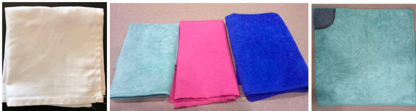
FIGURE 1. SuperTowel (ST) versions—left picture: ST0; middle picture: ST1, ST2, and ST3; and right picture: ST3 showing the scouter-like material in one corner.

with paper towels), and immersed up to the mid-metacarpals for 5 seconds with fingers spread apart in a contamination fluid containing nonpathogenic E. coli (ATCC 11229) 8.3 \times 10^8 cfu/mL. Excess of fluid was drained off, and the hands were air-dried for 3 minutes.