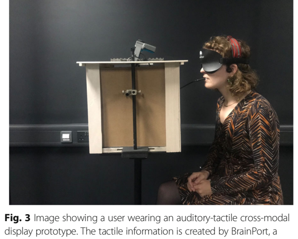
Fig. 3 Image showing a user wearing an auditory-tactile cross-modal display prototype. The tactile information is created by BrainPort, a visual-to-tactile sensory substitution device. The auditory information is created by The vOICe, an auditory-to-tactile sensory substitution device. The camera fixated within the box provides real time feed to BrainPort and The vOICe. As a result, the user can perceive the camera feed via audio, tactile and audio-tactile cross-modal feedback

Extensive research into sensory substitution techniques suggests that various sensory forms (e.g., auditory or tactile) could be utilised interchangeably to have access to the same sensory information (see Table 2). In