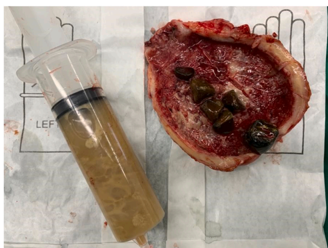
Fig. 3. Post-operative finding: gallbladder with thickened wall, multiple gallbladder stones and gallbladder empyema.

patients [5]. LC has many limitations, especially at a later gestational age where the uterus has filled a sizable abdominal cavity. Particularly in the third trimester, laparoscopic tools passing through the umbilical port can pose a large risk of uterine manipulation. Large uterus also hinders the movement of tools, resulting in poor vision and limitation of access for laparoscopic surgery [5].