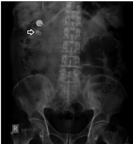
Figure 2: Postpercutaneous nephrolithotomy of the kidneys, ureters, and bladder X-ray showing residual calculi (arrow). There is a contrast in the Foley catheter balloon used as nephrostomy

available. [4] Prevention involves suppressing or eradicating flies, hygienic practices, regular wound inspection, and fly nets. [2]