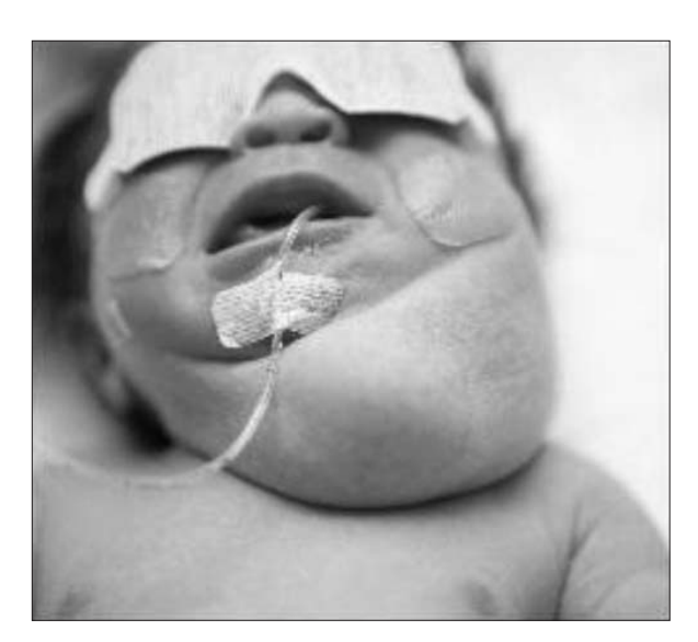
Fig. 1. Huge movable mass is found out on the left neck.