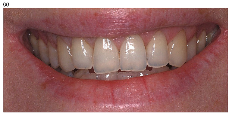
Fig. 1 a Picture of a frontal smile at baseline—coronally advanced flap group. b Picture of a frontal smile at end of follow-up—Coronally Advanced Flap group. c Picture of a frontal smile at baseline—Coronally Advanced Flap + Collagen Matrix Xenograft. d Picture of a frontal smile at end of follow-up—Coronally Advanced Flap + Collagen Matrix Xenograft