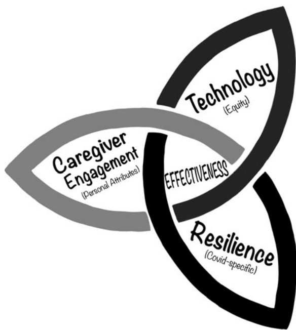
Fig. 2. Themes, subthemes, and their relationship to effectiveness of telehealth sessions.

Considerations, which may have impacted the effectiveness of telehealth.