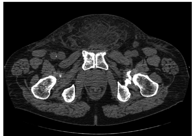
FIGURE 2 CT showing fat stranding in lower pelvic wall

Given his history of frequent sinus infections, malar rash and an elevated C-reactive protein (CRP) of 106.1, rheumatology consultation was obtained. Initially thought to be lupus, work up was negative. His original muscle biopsy was re-reviewed which revealed dense inflammation and differential diagnosis was whether this could be bortezomib-induced muscle necrosis or necrotizing Sweet syndrome or a yet unidentified condition affecting patients with dysregulated immune system who have been exposed to bortezomib.