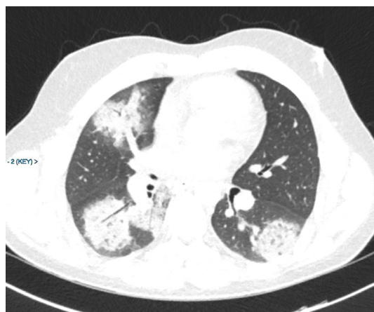
Figure 1 CT scan at admission showing multifocal bilateral consolidation.

On initial presentation, the patient was diagnosed with gastroenteritis due to predominant symptoms of diarrhoea and abdominal pain. Renal colic or pyelonephritis was later suspected due to the severity of abdominal pain with only mildly raised CRP.