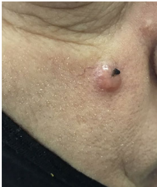
FIGURE 1 Right upper cheek, 1 cm × 0.5 cm translucent nodule