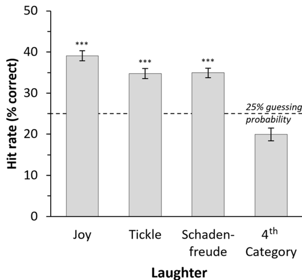
Figure 1. Classification results for Experiment 1. Data combined for all three runs (total N = 159; total number of stimuli = 381). In all runs, Joy, Tickle, and Schadenfreude laughter were presented, plus one additional fourth category (Pity in run 1, Embarrassment in run 2, and Cute-emotion in run 3). Data for the variable fourth category are averaged (see Results for details). ***Hit rate is significantly ( p < .001 ; one-sample t-tests, Bonferroni corrected) higher than the guessing probability of 25% (confirmed by calculation of the unbiased hit rate H_u 36 , see Results). Error bars denote standard error of the mean (SEM).

horizontally on the screen. Participants were asked to first listen to the full laughter sequence before giving their answer. They were able to listen to the same sequence as many times as they wished before giving an answer. Once an answer box has been selected, the next laughter was played. The stimuli within a run were presented in three blocks, and participants were able to have a break between each block. Participants judged between 104 and 141 laughter stimuli per run (see Table 1 for details).