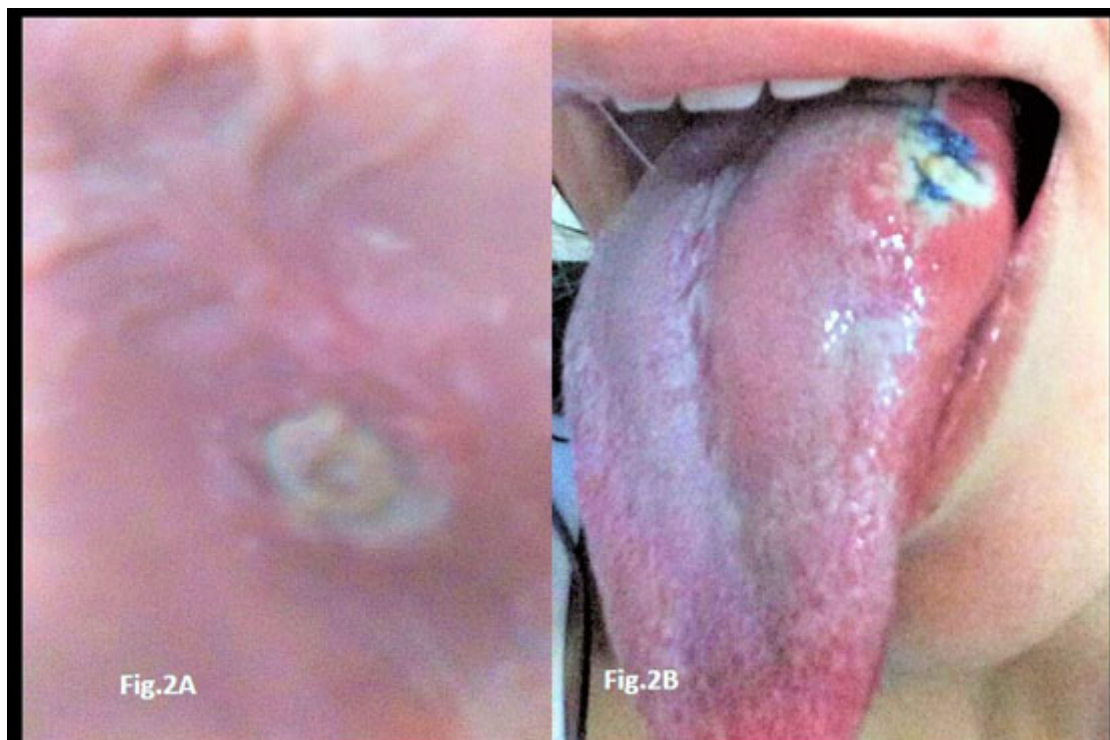
Figs. (2). The recurrent aspects of the case both pictures were self-taken, one on hard palate and the other on the lateral border of the tongue, with the purpose of showing the recurrent nature of the present case.

Microscopic observation revealed a specimen of oral mucosa partially coated by a stratified squamous epithelium with an extensive ulcerated area covered by fibrin and neutrophils. The lamina propria was constituted by a dense connective tissue with an intense chronic inflammatory infiltrate constituted by lymphocytes and plasma cells that spread diffusely deep into muscle bundles. Eosinophils were frequently seen amidst the inflammatory infiltrate. This chronic inflammatory process with ulceration and eosinophilia is fully compatible with a clinical diagnosis of OEU (Figs. 3A, B).