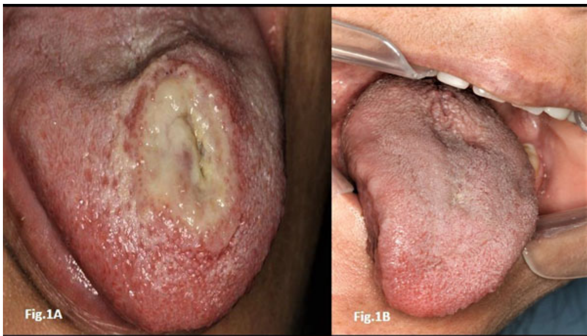
Fig. (1). Initial presentation and resolution after biopsy. A typical lesion that supports a diagnosis of oral eosinophilic ulcers, i.e. , a large and rounded ulceration on the tongue's dorsal surface. The ulceration also shows an elevated border and a yellowish exudate; 1B, – the photographic shows a completed healing of the ulceration along with a full re-papillation of the tongue within six weeks after a biopsy was taken.