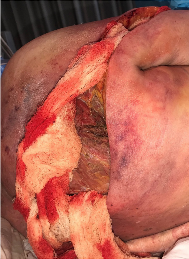
Fig. 1. Despite initial broad resection of devitalized skin, fascia, and muscle, areas of ecchymosis and tissue necrosis continued to evolve on the patient's upper back.