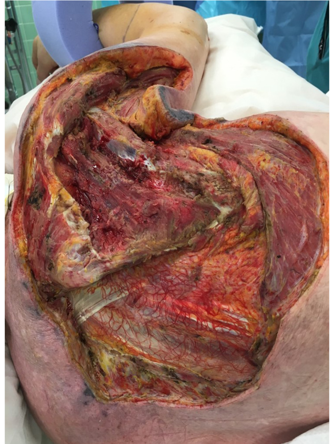
Fig. 2. Healthy wound margins were obtained after a second debridement, and the patient stabilized subsequently.

Nine days after admission she was transferred by air ambulance to a hospital in Vancouver to be nearer her family. Ceftriaxone was stopped after fourteen days of total therapy. She underwent extensive skin grafting, and is receiving treatment for her CLL/lymphocytic lymphoma currently.