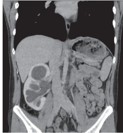
FIGURE 1: UPJO in solitary kidney with intrarenal pelvis in urography images by CT scan.