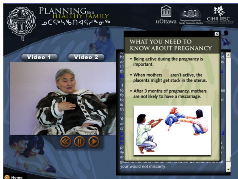
Fig. 1. Screen shot of message 1: Summary slide view (English).

For qualitative data collection, interviews were conducted prior to viewing the CD-Rom, and a focus group was conducted at follow-up (approximately 3 months after viewing the CD-Rom). The interview items were used to explore participants’ expectations about