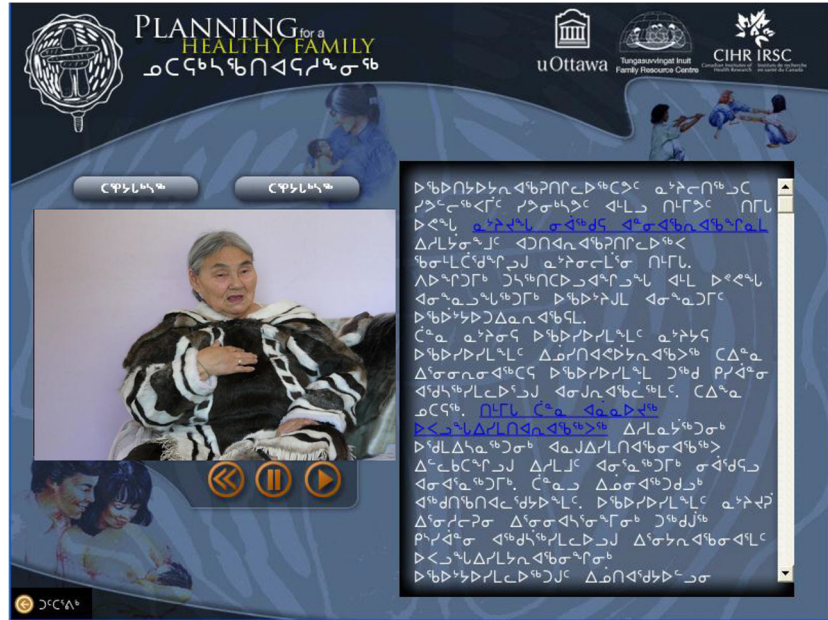
Fig. 2. Screen shot of message 2: Video view (Inuktitut).

the CD-Rom (e.g. “Tell me what you think it will be like to use the CD-Rom”) and participants’ experience with the CD-Rom (e.g. “How was the CD-Rom different than what you expected?”) and evaluations of features of the CD-Rom (e.g. “What did you like the most about the CD-Rom?”). Questions at the focus group examined how the CD-Rom as a health promotion tool compared to other tools and explored suggestions for changes (e.g. “How does the CD-Rom compare to other ways of sharing health information?”). All materials were translated into Inuktitut prior to commencing the data collection. In addition, an interpreter was used to translate questions during the focus group.