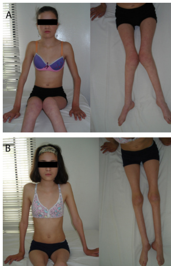
Figure 1. A. Case 1 B. Case 2 Patient. Both patients developed similar symptoms. Note the severe and symmetric muscle hypotrophy of limbs, contracture deformities of the fingers and elbows, marked atrophy of tenar, hypotenar and interosseous muscles of the hands, pes cavus, without dysmorphic features.

A 14-year-old female was referred to our consultation, with a progressive deformity in valgus of inferior limbs and muscle hypotrophy (Fig. 1a). The onset was at 15 months old. She gradually developed gait instability, reduced range of motion on hands and arms, and impaired gross and fine motor skills. She is the second child of a mother Gravidia 3 Para 3, and healthy consanguineous parents. The pregnancy was uneventful, vaginal delivery at 39 weeks, with birth weight 2,600 g (5th centile), and birth length 45 cm (25th centile). Developmental milestones were normal, with sitting at 6 months, and walking at 15 months of age. Intelligence is normal, with overall good academic performance. At general examination, she was a wheelchair bound but otherwise healthy appearing girl. Her weight was 25 kg (3rd centile), her height was