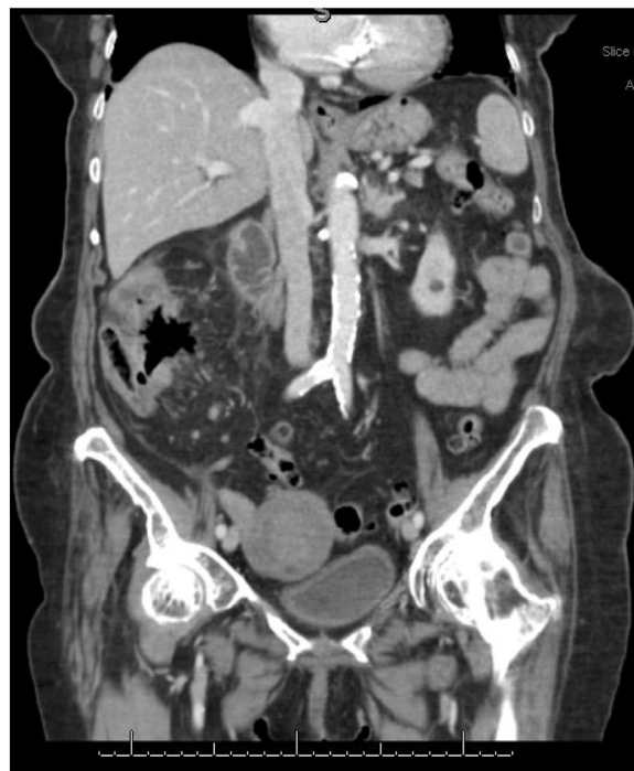
Fig. 2. Coronal Computed Topography of Abdomen with Focal Perforation and Loculated Extraluminal Air Density.

Clostridium septicum is associated with colorectal cancer [7]. Colorectal tumors produce an acidic microenvironment through tumor anaerobic metabolism, and it is thought that C. septicum can