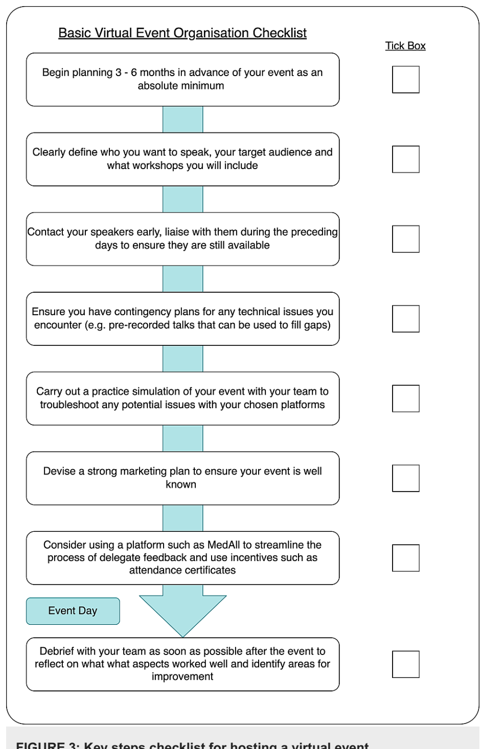
FIGURE 3: Key steps checklist for hosting a virtual event.