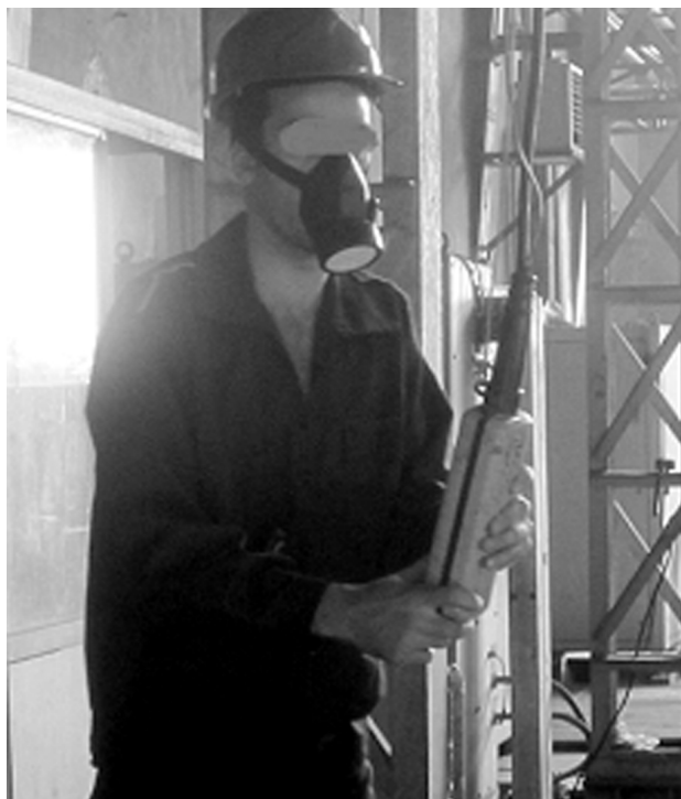
Figure 2. Use of NP305 mask in the pickling plant workers

The concentrations of the air pollutant samples were measured by comparing the average peak measured with the calibration curve drawn using 5 to 500 micrograms per milliliter concentrations of practical solutions of sulfuric