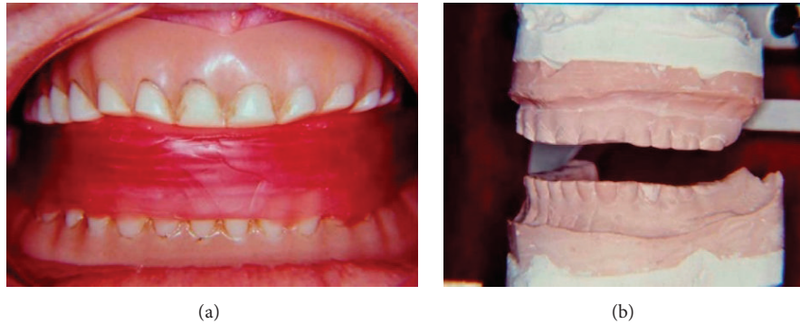
FIGURE 2: Record for reestablishment of 14 mm in the OVD. (a) Record in wax with 14 mm; (b) second master cast set mounted in a semiadjustable articulator.