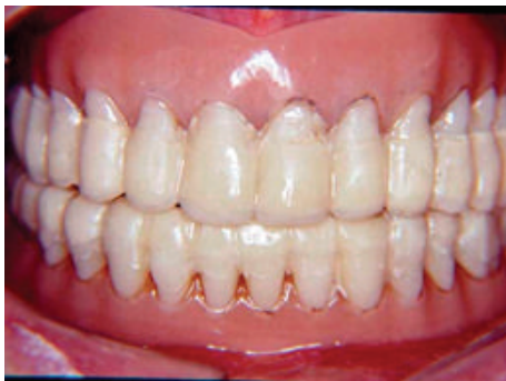
FIGURE 5: Installation of the mandibular occlusal splint after a 30-day period of adaptation.