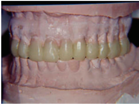
FIGURE 3: Waxing of the maxillary cast for manufacturing a maxillary occlusal splint for a 7 mm increase in OVD.

to tolerate the proposed reestablishment of the OVD and evaluate her ability to adapt.