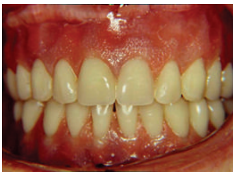
FIGURE 6: Installation of the new complete denture set after the adaptation of OVD of 14 mm.