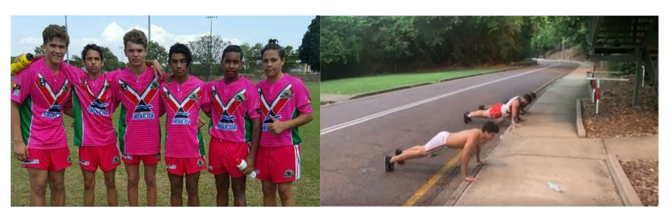
FIGURE 4 Example images of participation in team sports and physical activity [Colour figure can be viewed at wileyonlinelibrary.com]