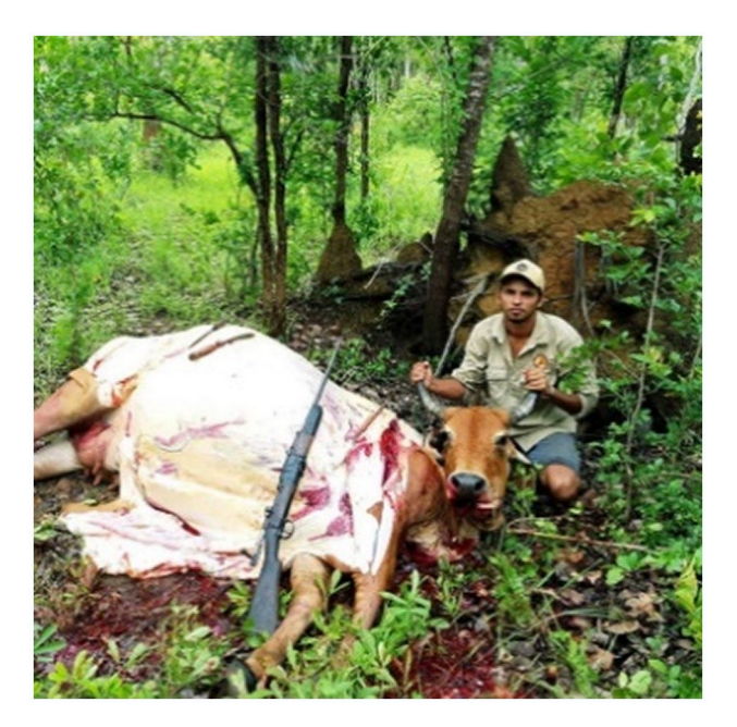
FIGURE 2 Example image of engagement of on-country activities (eg hunting) [Colour figure can be viewed at wileyonlinelibrary.com]