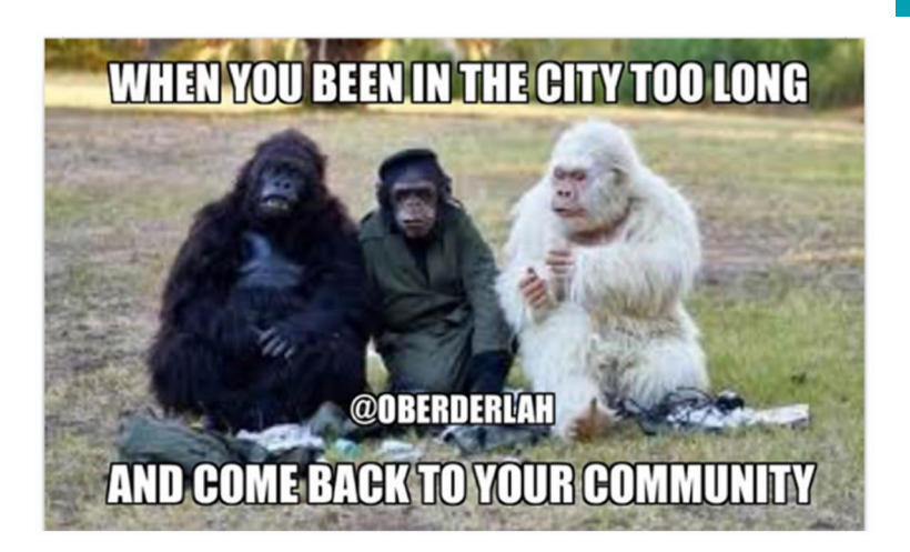
FIGURE 3 Example meme of identify formation [Colour figure can be viewed at wileyonlinelibrary.com]