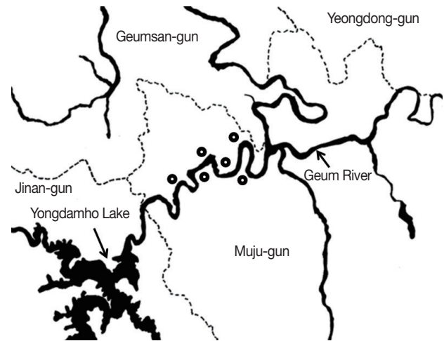
Fig. 1. Location of surveyed areas in Bunam-myeon, Muju-gun, Jeollabuk-do, Korea. Dot (●); survey areas in Muju-gun along the Geum River basin.

Stool specimens were collected in plastic containers and transferred to the laboratory of the Korea National Institutes of Health, Osong, Chungcheongbuk-do. A part (1 g) of each fe-