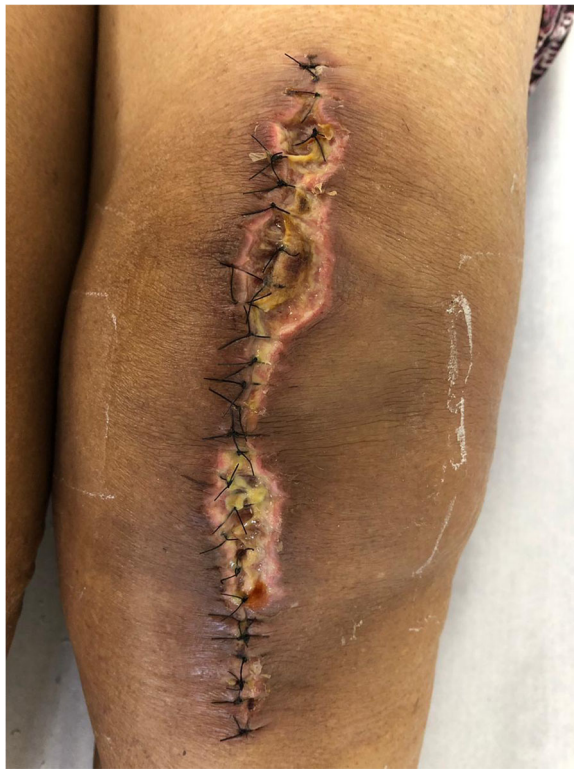
Fig. 5 Dehiscence of the surgical wound associated with prosthesis infection in a patient with rheumatoid arthritis who underwent primary total arthroplasty of the left knee and used conventional dressings; 14 days postoperatively

of interventions in non-infected surgical wounds with dehiscence, 7 cases of surgical cleaning with a polyethylene insert exchange due to infection and 1 case of washing and closing of a fistula at the surgical drain site.