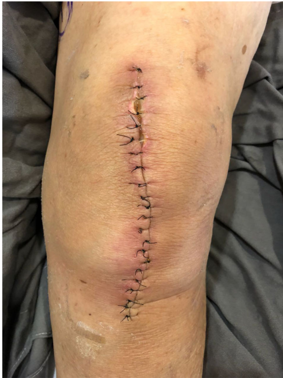
Fig. 3 Proximal dehiscence of the surgical wound and hyperaemia around the entire wound of a patient without clinical comorbidities who underwent primary total arthroplasty of the left knee and used conventional dressings; 14 days postoperatively