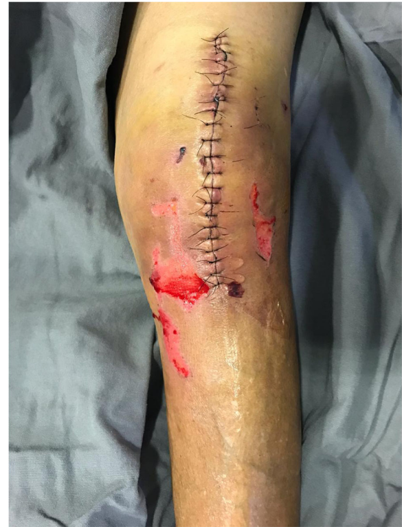
Fig. 4 Blisters around the surgical wound of a patient with rheumatoid arthritis and diabetes who underwent total primary arthroplasty of the left knee and used conventional dressings; 14 days postoperatively

median (interquartile range). Statistical significance was considered when the p value was less than 0.05. The statistical software SPSS 22 (IBM Corp., NY, USA) and G*Power 3.1.9.3 (Erdfelder, Faul, & Buchner, Universität Düsseldorf, Düsseldorf, Germany 2009) were used to perform the analysis.