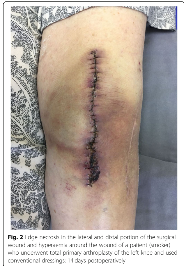
Fig. 2 Edge necrosis in the lateral and distal portion of the surgical wound and hyperaemia around the wound of a patient (smoker) who underwent total primary arthroplasty of the left knee and used conventional dressings; 14 days postoperatively

For the univariate analysis, Pearson's chi-square test and the Fischer test for categorical variables were