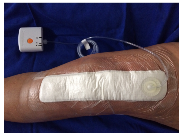
Fig. 1 Patient with a left total knee arthroplasty using the PICO® device for negative-pressure wound therapy in the immediate postoperative period

Surgery was performed with the use of a pneumatic tourniquet through an anterior knee incision and trans quadriceps and medial parapatellar approach. The procedures were always performed with resection of the posterior cruciate ligament (PCL). All cases were performed with cemented components without antibiotics. The subcutaneous tissue was closed with 3–0 Vicryl sutures, and the skin was closed with simple 4–0 nylon sutures. Antibiotic prophylaxis was performed with cefuroxime for 24 h for all cases. Drains were used for a maximum period of 24 h, regardless of the draining volume, and the sutures were removed between the 14th and 21st days after surgery, according to the outpatient