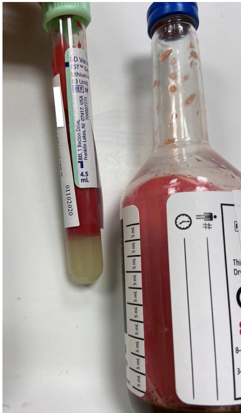
Figure 1 Clinical photograph of this patient's blood taken on presentation in the emergency department (colours not digitally edited).

with normokalaemia (Serum glucose 31.5 mmol/L, urea 7.2 mmol/L, serum osmolality 312 mOsm/kg (calculating formula: 2 \times (\text{Na}) + (\text{glucose}) + (\text{urea}) ; usual range 270–285)) (table 1, S/N 2).