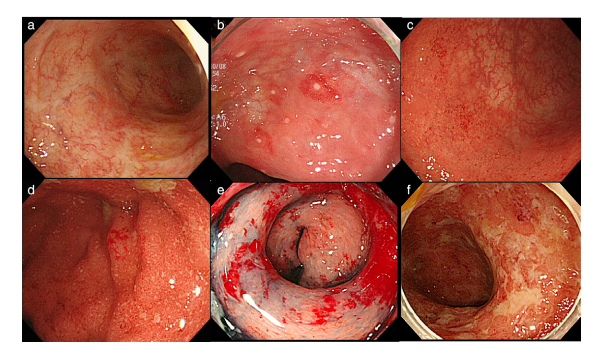
Figure 1 Representative endoscopic findings shown in the order of the severity of inflammation on endoscopy. a. Noninflamed mucosa in remission, with scar formation after ulcer healing. b. A small red sign was found in the noninflamed mucosa, and a small erosion can be seen in the small red sign. c. In the distal portion of the picture (near side), visible vascular patterns disappeared. In the proximal portion (far side), visible vascular patterns remained, suggesting noninflamed mucosa. d. An edematous, granular, rough mucosa. In the center of the picture, microbleeding can be observed, a finding of friable mucosa that bled on contact with the endoscope tip. e. Diffuse exudative spontaneous bleeding. f. Multiple map-like ulcers arose in diffusely inflamed mucosa.

The study group comprised 191 patients with ulcerative colitis, consisting of 123 (64.4%) males and 68 (35.6%) females, with a median age of 47 years (range, 8–82). A total of 537 biopsy samples were obtained. The maximum number of samples taken per patient was 9 (Table 1). Among the 537 biopsy specimens obtained, 10 specimens were excluded: 9 (1.7%) were severely crushed and could not be evaluated histologically, and 1 (0.2%)