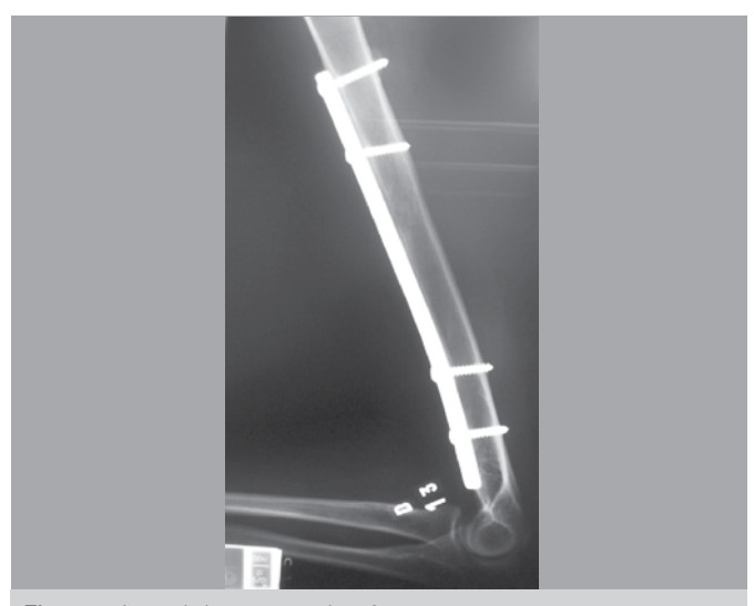
Figure 6. Lateral view, 30 months after surgery.