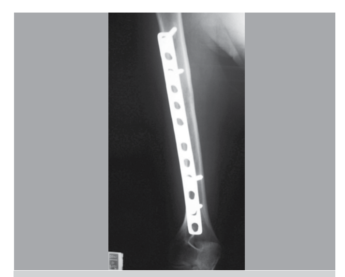
Figure 5. Anteroposterior incidence, 30 months after surgery.

Conservative treatment of fractures of the humeral shaft in isolation can achieve good results; angular and rotational deviations are well compensated by the large range of motion of the shoulder with little or no aesthetic or functional impairment.<sup>8,17</sup>