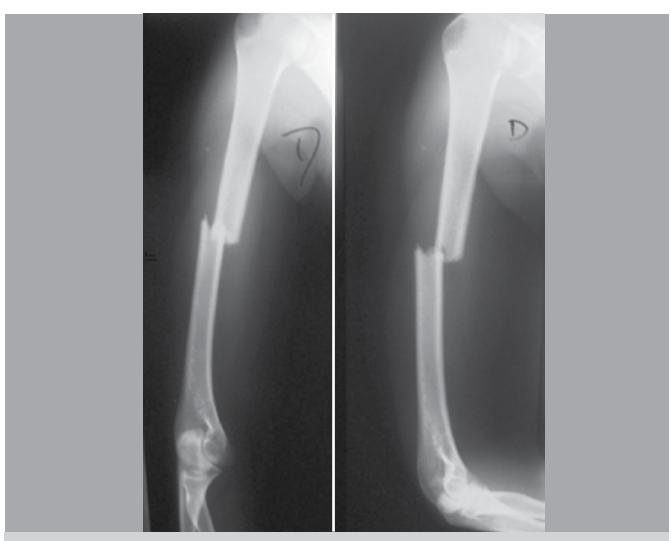
Figure 2. Preoperative anteroposterior and lateral radiographs incidence.