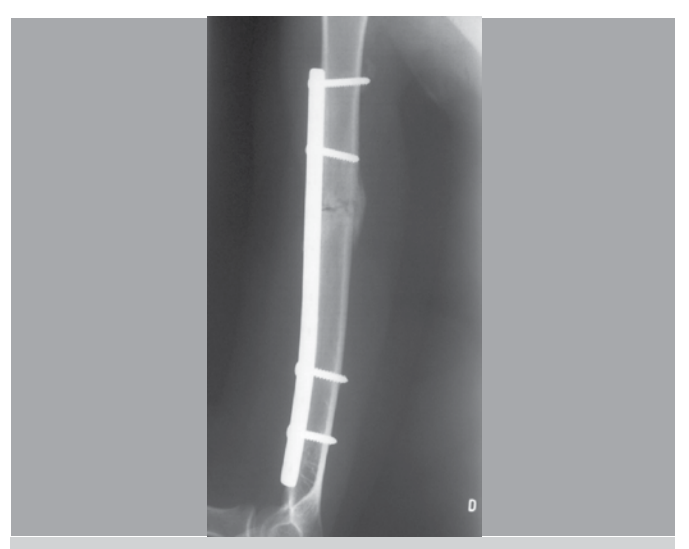
Figure 4. Lateral incidence six weeks after surgery.