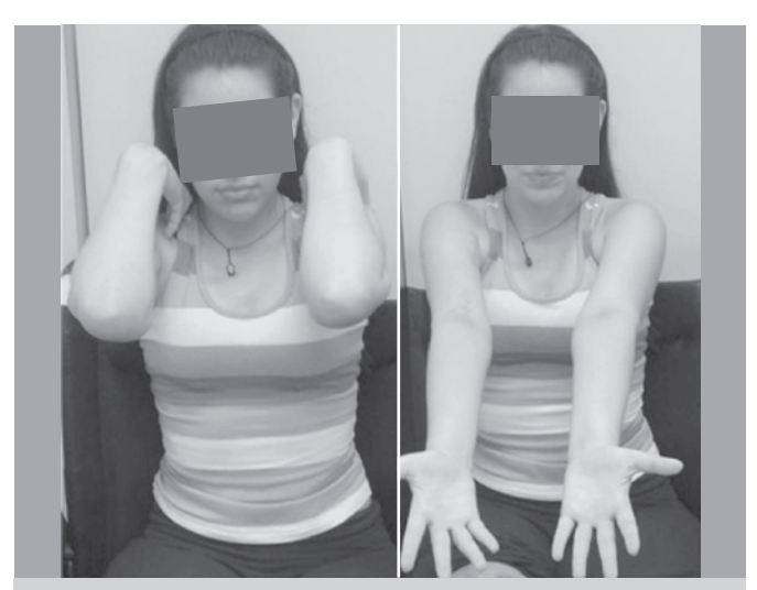
Figure 7. Thirty months after surgery, showing excellent arch of movement (fractured side: right).