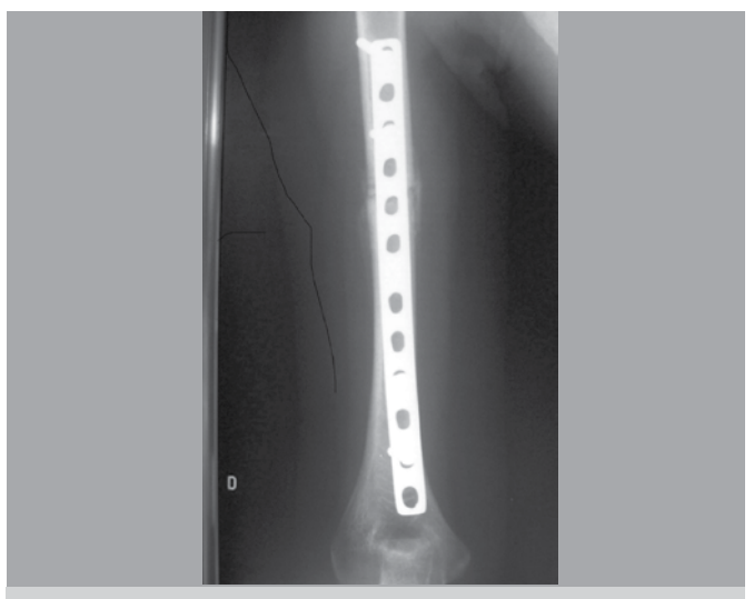
Figura 3. Anteroposterior incidence, 6 weeks after surgery.