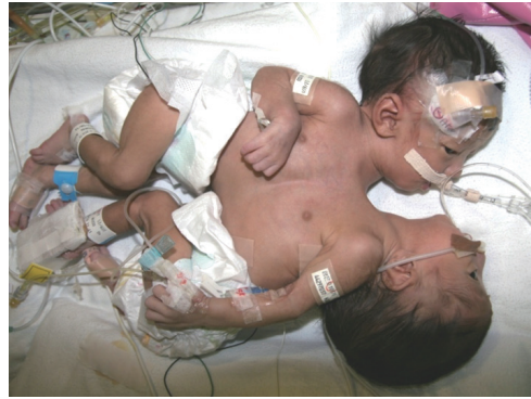
Fig. 1. A 13-day-old thoraco-omphalopagus conjoined twins who shared the heart and the liver.

Conjoined twinning is one of the most uncommon congenital anomalies. Spencer has reported that while the incidence of conjoined twinning is close to