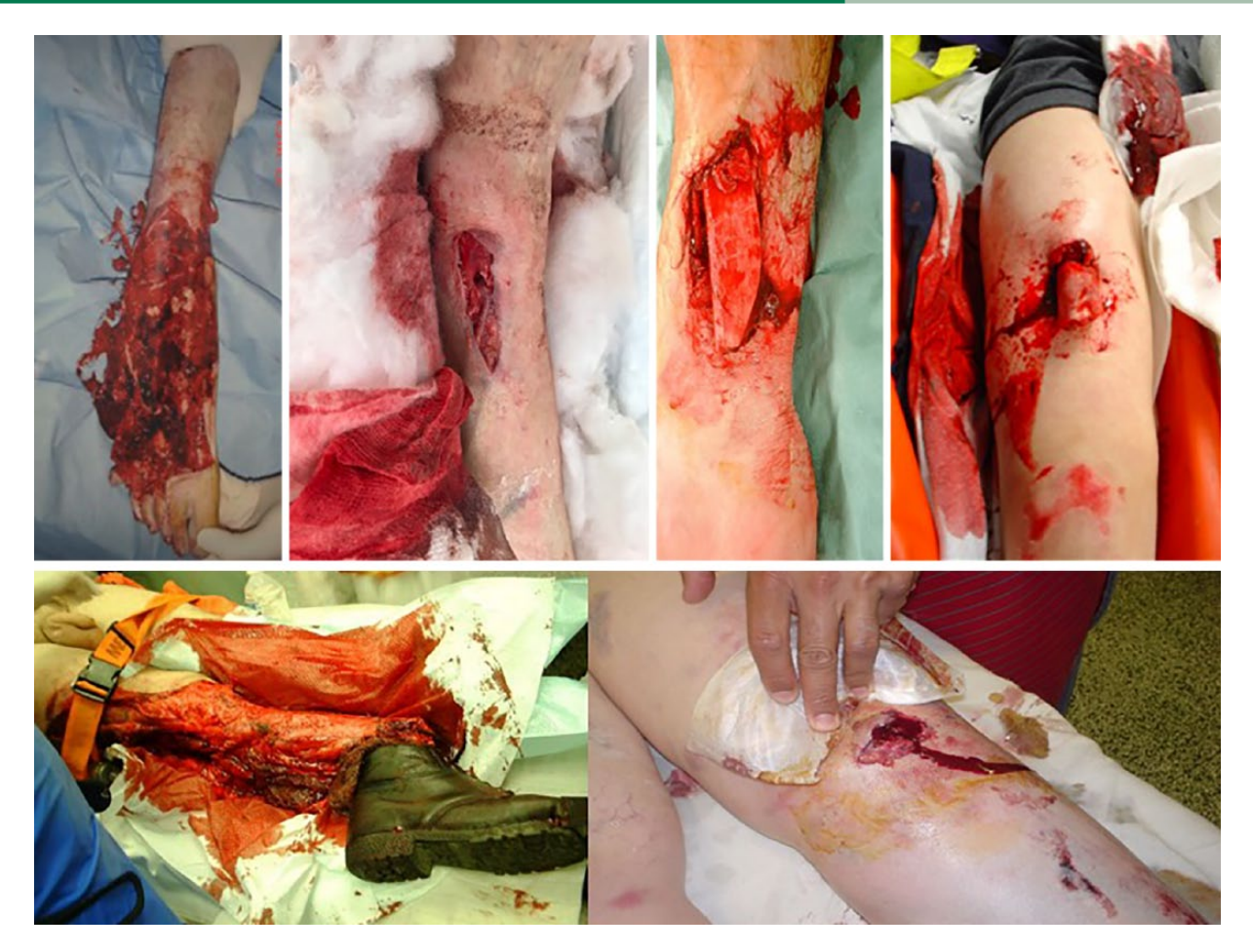
Fig. 1 A spectrum of injury severity of open tibial fractures exists.

described the many limitations of the classification,<sup>6</sup> with particular emphasis on the limited inter-observer reliability, with as little as 60% concordance between observers<sup>7</sup> and other studies showing only moderate agreement between those using the system.<sup>8</sup> In addition, the classification system does not consider the degree of soft-tissue injury and therefore may be limited in its evaluation of long-term tissue viability.<sup>6</sup> The classification shows some value as a prognostic indicator and a useful guide towards treatment. Other classification systems may, however, better classify open fractures and their associated softtissue injury in severity.