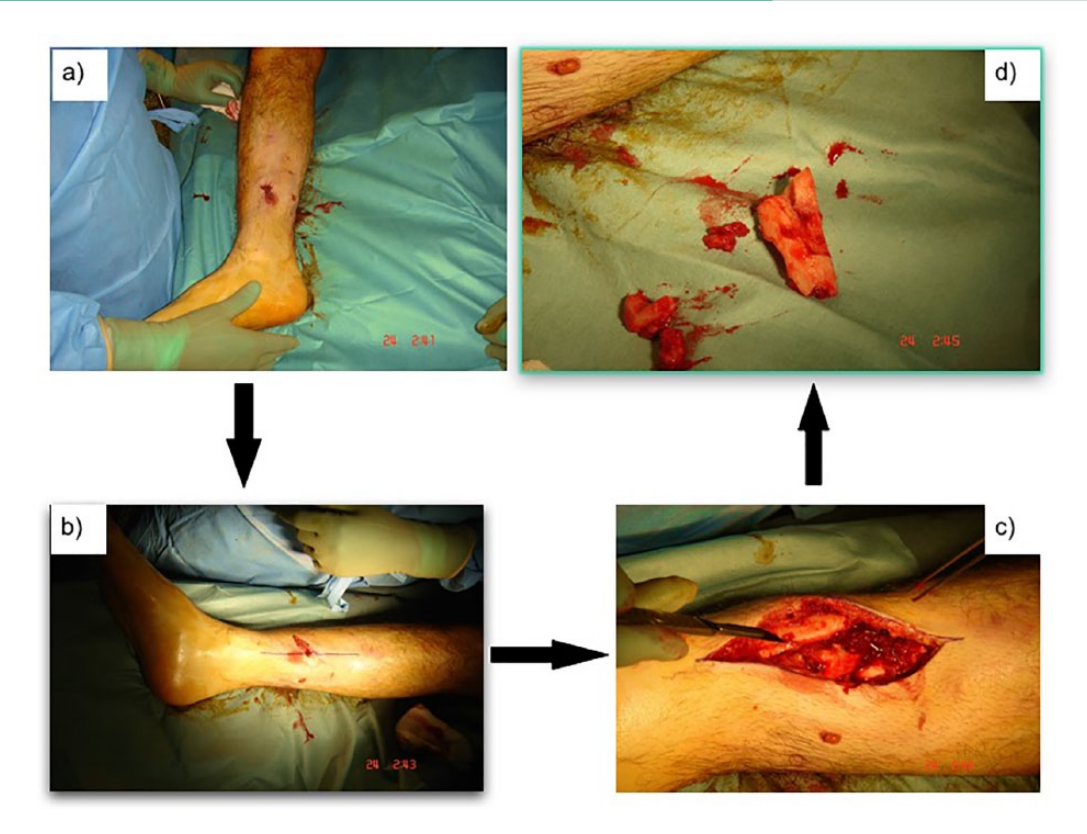
Fig. 2 The importance of wound debridement: a) grade I open tibial fracture; b) skin incision marked before debridement; c) exposure of the zone of injury; d) removal of devitalized (avascular) bony fragments.

early following presentation or is delayed,<sup>22,23,26,27</sup> given that appropriate antibiotic cover is established immediately. Schenker et al<sup>27</sup> performed a meta-analysis on the effect of timing on the overall risk of infection in open long bone fractures, finding no difference in the rate of infection of delayed debridement, irrespective of injury severity or anatomical location. The BOA/BAPRAS suggest debridement be carried out within 24 hours of injury<sup>21,23,24</sup> on scheduled trauma lists, combining plastic and orthopaedic involvement where possible.