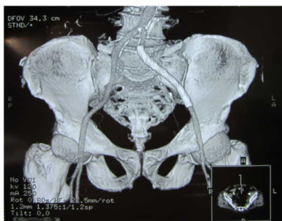
Figure 3 Imaging of computed tomographic angiography after 30 days of discharge. Contrast-enhanced computed tomographic angiography after 30 days of the treatment revealed a well-expanded stent and total occlusion of pseudoaneurysm.

transplantation [4], interventional procedures [5] or neoplasia [6] that cause laceration of part of the vessel wall and extravasation of blood into surrounding tissues, followed by tamponade and clot formation. Typically, PAs present with pulsatile masses, compressive symptoms, secondary hemorrhage and neurologic deficit as the most common clinical manifestations. However, even spontaneous PAs or PAs without clear origins are clinically rare; they have been reported to occur in the facial artery [7], tibioperoneal trunk and anterior tibial artery [6], lumbar artery [8] and superficial femoral artery [9], presenting as pulsatile masses in the former two cases and as ruptured hemorrhage in the latter two respectively.