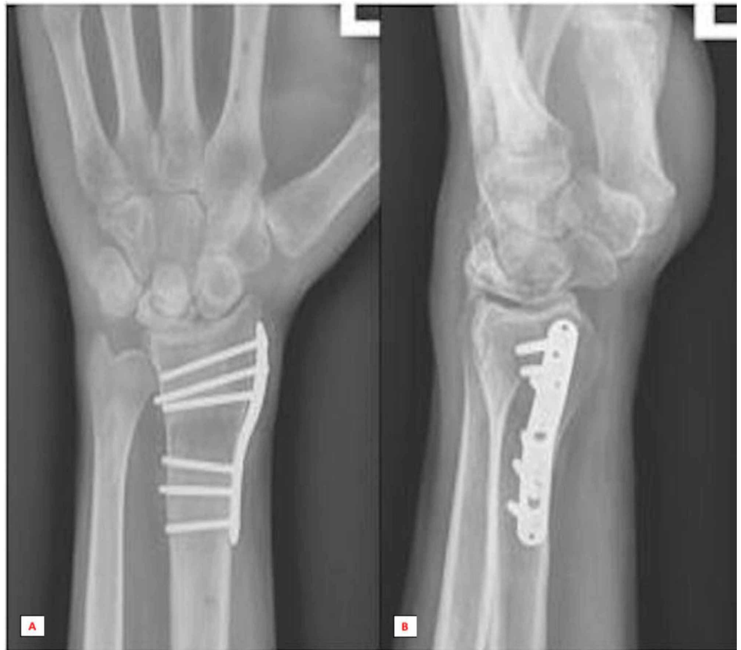
FIGURE 4: Anterior-posterior (A) and lateral (B) radiographic series at six months post-surgical follow-up revealed the complete collapse of the lunate.