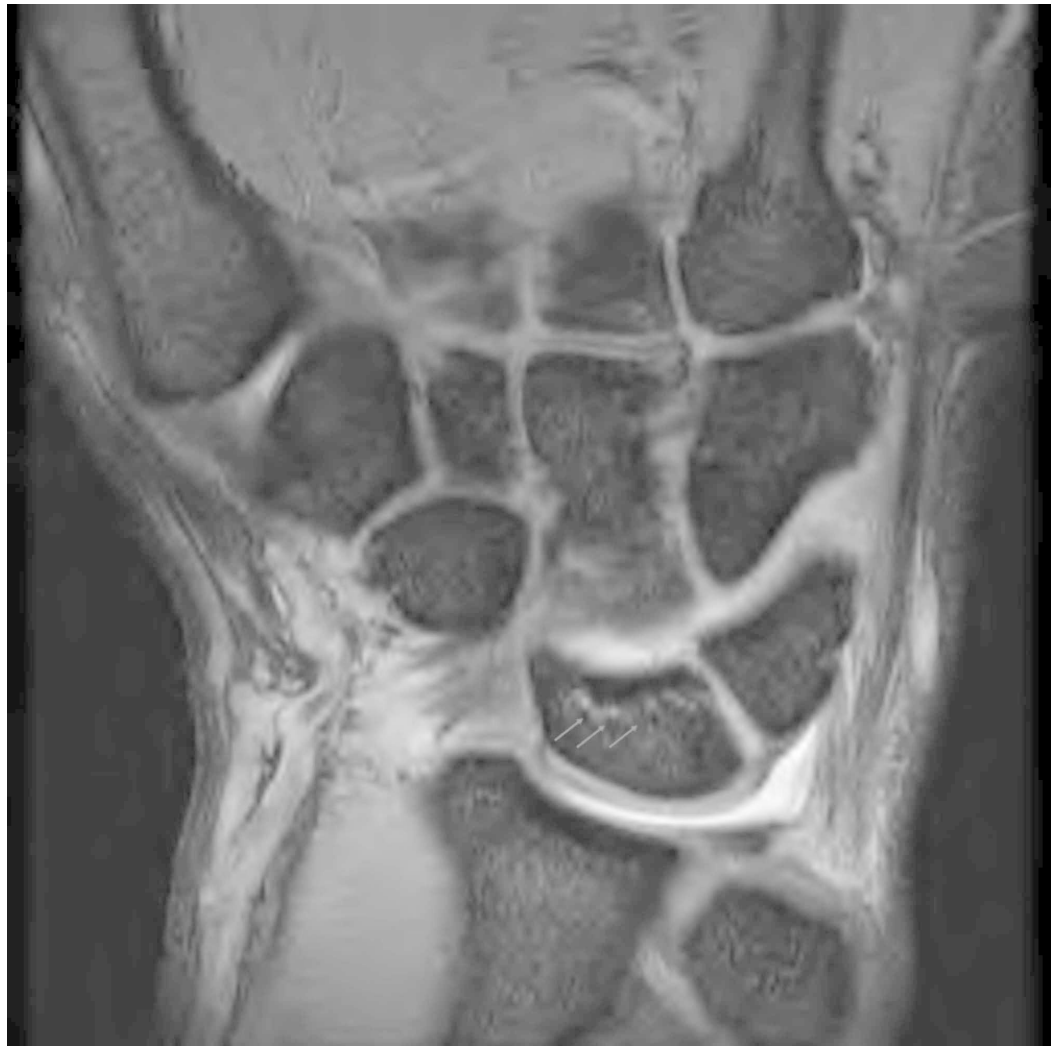
FIGURE 3: Coronal T2-weighted MR image showed mild increase in the signal intensity of the lunate bone.