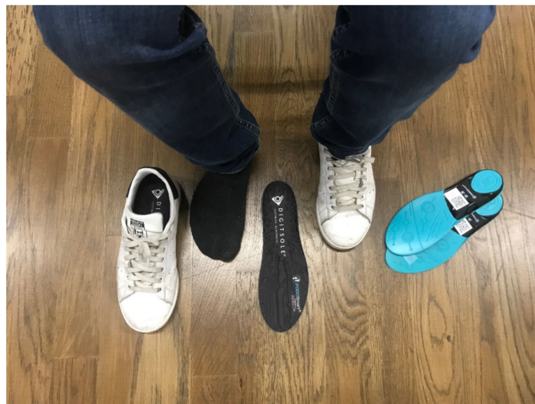
Figure 2. Subject preparation and PODOSmart ® insoles fitting.

Data of the spatial and temporal gait parameters were recorded. PODOSmart ® insoles were installed inside participants' shoes (Figure 2). Participants were requested to walk on a 6-m walkway located within the Motor Control and Adapted Physical Activity laboratory at the Department of Physical Education and Sport Science of the Aristotle University of Thessaloniki. Each participant performed two walking trials at their preferred walking speed. During walking acquisitions, turns and U-turns were allowed. The interval between the two trials was 20 min. Participants were informed that they could perform practice walks to get acquainted with the experimental procedure's insoles. Additionally, they were asked to wear sport shoes, t-shirts and shorts in order to feel comfortable. During the measurements, participants were instructed to walk at a self-selected speed.