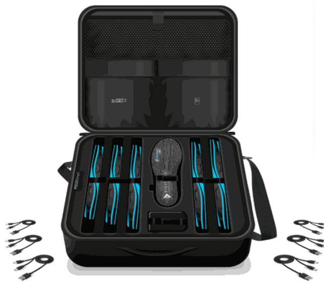
Figure 1. PODOSmart ® insoles gait analysis kit.

Repeatability or test-retest reliability indicates the agreement between multiple assessments of the same measurement under the same conditions [4]. It is commonly assessed using the calculation of intraclass correlation between the first measurement and subsequent measurement [5]. With respect to the motion system, repeatability can be considered more important than accuracy [6]. Hence, the evaluation of repeatability is of great importance when developing new measures for gait analysis. The confirmation of repeatability means that the administrations of the measure at two distinct occasions result in consistent measurements. In turn, it implies the precision of measurements [7].