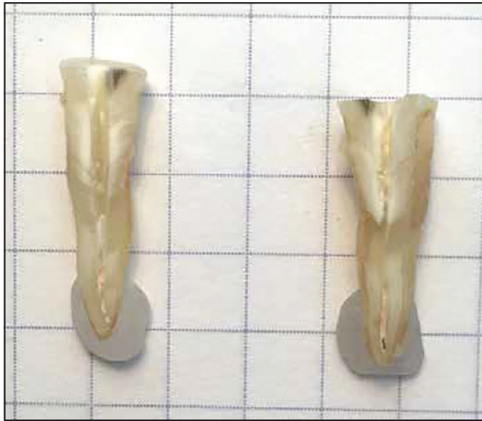
Figure 2. Setup for evaluation of root segments in microscopic photographs