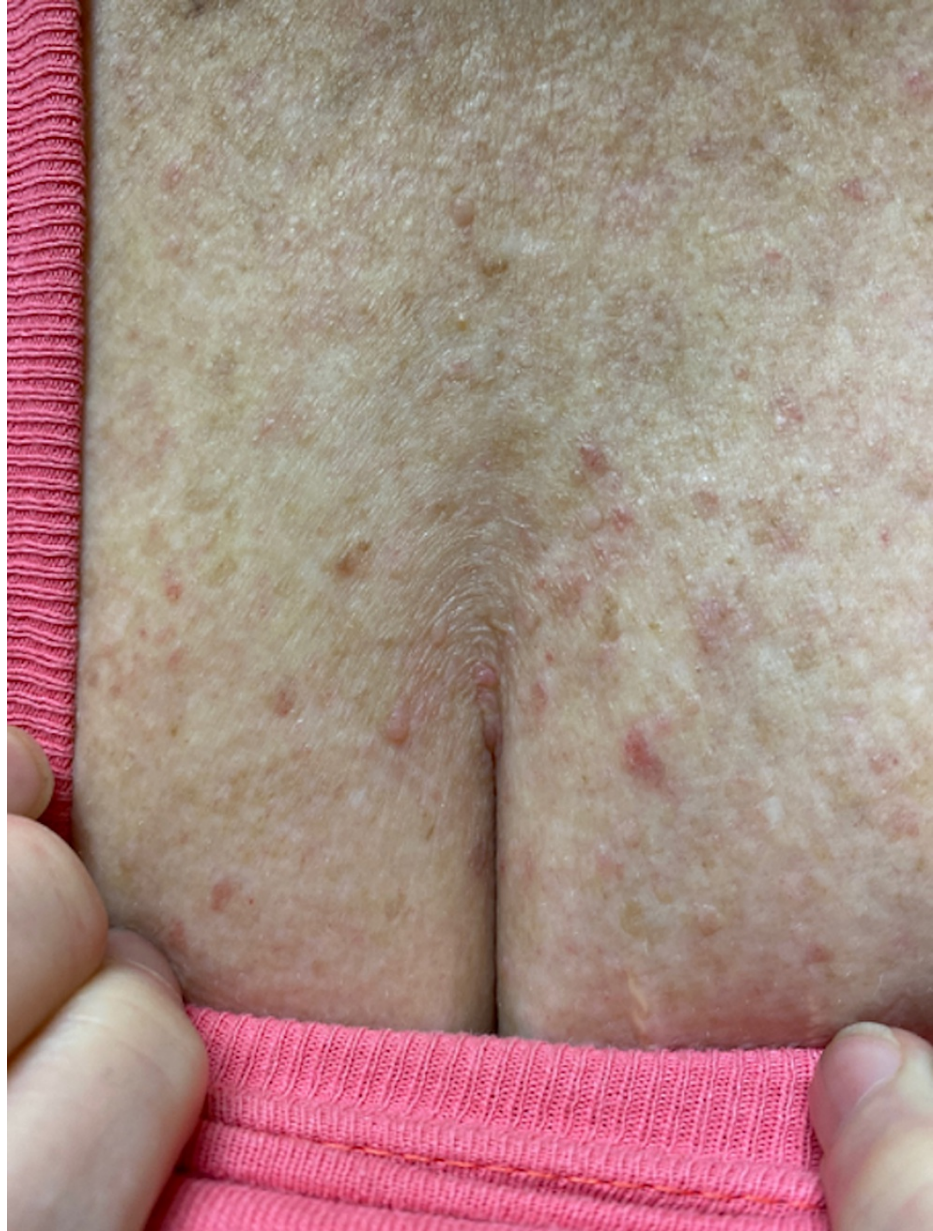
FIGURE 1: Photograph of the patient's anterior chest.

The patient was in no acute distress and walked into the ONMM clinic without assistance on the initial visit. Vital signs and body mass index were within normal range. Neck exam was significant for diffuse cervical crepitus, rigidity, tenderness, and pain with motion. Musculoskeletal survey revealed decreased passive range of motion throughout the axial skeleton. Skin was warm, dry, and intact with a truncal maculopapular rash (Figure 1).