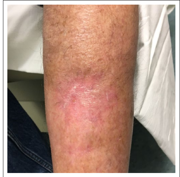
Figure 5. Complete resolution of wound 2 months after discharge from wound clinic.

As mentioned in the case presentation, the patient was treated for infective cellulitis shortly after the first cycle of gemcitabine treatment. Aside from infective cellulitis, a differential diagnosis would be pseudocellulitis (non-infective cellulitis). Pseudocellulitis has been reported as an adverse reaction of gemcitabine and is frequently misdiagnosed as an infection and inappropriately treated with antibiotics. Reported cases of patients treated with gemcitabine who presented with cutaneous reactions resembling cellulitis include a patient with erythema, pain, and swelling over the anterior chest after being exposed to one cycle of gemcitabine. 4 This was assumed to be infective cellulitis and was treated with cephalexin. However, the patient's symptoms worsened