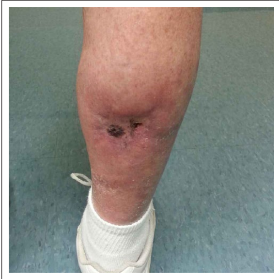
Figure 1. Initial presentation of wound at the medical oncology clinic.

IV infusion over 30min on days 1, 8, and 15 of a 28-day cycle.