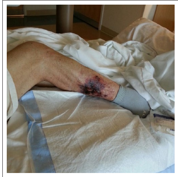
Figure 2. Progress of wound during hospital admission.

Two weeks after completing the six-cycle regimen, the patient presented with a wound on the posterior aspect of the right calf with no evidence of underlying fluid collection, mass, or active bleeding. He also complained of right knee pain and swelling and denied any recent trauma to the leg. These symptoms were distinctly different from the infective cellulitis treated 5 months ago. Although he had hypertension and a smoking history, his symptoms were inconsistent with peripheral vascular disease or arteriosclerosis obliterans as he did not have signs of circulatory insufficiency and did not have symptoms of intermittent claudication. Full blood count revealed mild anaemia but did not reveal an ongoing infective or allergic process. However, his erythrocyte sedimentation rate (ESR) was elevated at 85mm/h. His CA 19-9 was mildly elevated at 60 \mu /mL. However, immune complex deposition was not examined in these samples and an autoimmunity screen was not performed (Figures 1 and 2).