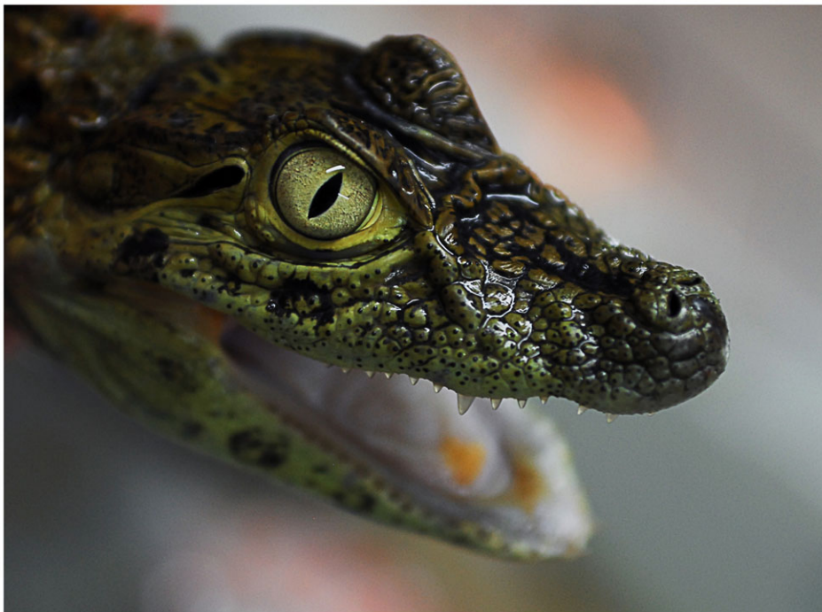
Fig. 1. Juvenile broad-snouted caiman ( Caiman latirostris ) studied in captivity at the Alligator Bay Zoological Park (Mont-Saint-Michel, France). The most notable physical characteristic is its broad snout adapted to rip through the dense vegetation while foraging for food.

where t is the time in days, \alpha is % turnover (e.g. half-lives \alpha=50 ), and c is the turnover rate of the tissue. For muscle, isotope incorporation was quantified using the values at T_0 , T_{97} , and T_{189} .